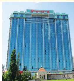
SHERATON ON THE FALLS