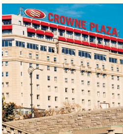
CROWNE PLAZA FALLSVIEW

Visit cityescapes.com for hotel descriptions