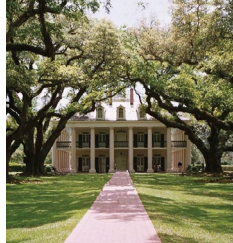
OAK ALLEY PLANTATION