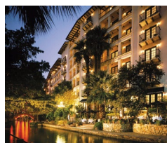
OMNI DEL RIO RIVERWALK

Your Tour Package Includes 2 nights hotel & tax plus the Following Activities: