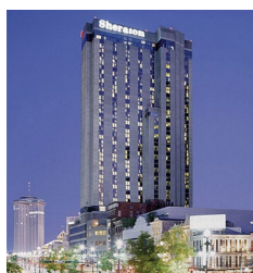
SHERATON NEW ORLEANS