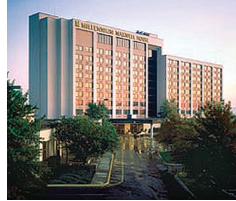
MILLENNIUM MAXWELL HOUSE