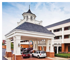
INN AT OPRYLAND

Visit www.cityescapes.com for hotel descriptions