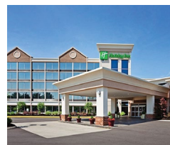
HOLIDAY INN RESORT

Children are free in room at all hotels under 18 years. Rate for children's Dollywood admission: $45.