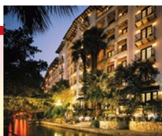
OMNI DEL RIO RIVERWALK

Effective dates: 1/1-12/31 * Rate Includes American Breakfast for two days for each Adult guest! Children are free in room with parents, under 18 yrs. Rates for activities available on request.