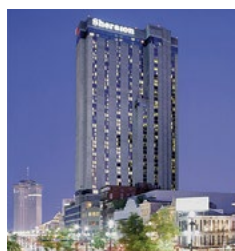
SHERATON NEW ORLEANS