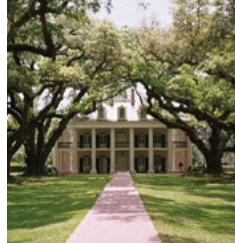
OAK ALLEY PLANTATION