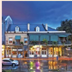
W FRENCH QUARTER