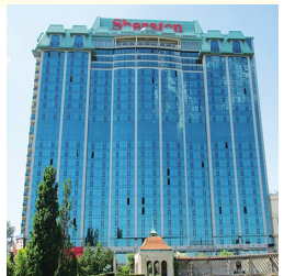
SHERATON ON THE FALLS

Visit www.cityscapes.com for hotel descriptions