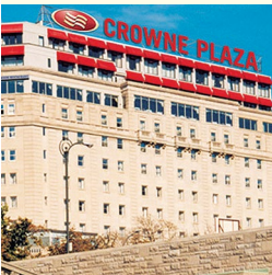
CROWNE PLAZA FALLSVIEW

Effective dates: 5/16-10/15. Rates in early and late part of the year available on request. Children are free in room at all hotels under 18 yrs; children's rates for features inclusions available on request.