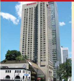
LE CENTRE SHERATON MONTREAL

Your Tour Package Includes 2 or 3 nights hotel & tax plus the Following Activities: