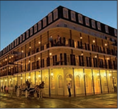
INN ON BOURBON

European ambience and southern hospitality are combined in this charming inn. Tropical courtyard with pool. Dine at the Louisiana Heritage Café & School of Cooking. 83 luxurious guest rooms and suites, with coffee maker, hairdryer, newspaper and free use of nearby health facility. Continental breakfast. Walk to shopping, dining, art galleries and sightseeing.