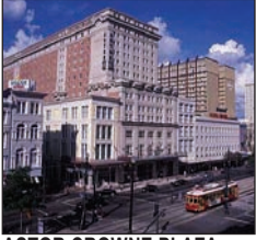
ASTOR CROWNE PLAZA