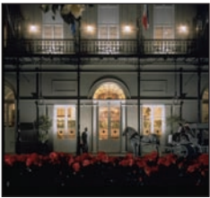
OMNI ROYAL ORLEANS

568 comfortable guest rooms and suites. A perfect place to rejuvenate from a busy day or night exploring New Orleans. The elegance of old New Orleans with the modern conveniences of today. Rooftop pool, fitness area, room service, business center, and multi-lingual concierge. Near many art galleries and great restaurants.