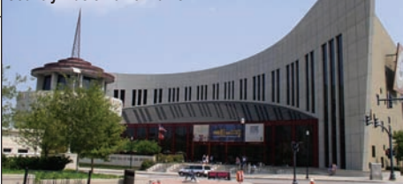
Country Music Hall of Fame