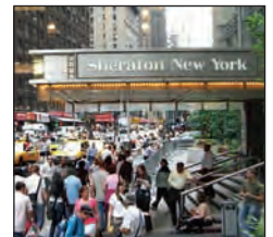
SHERATON NEW YORK