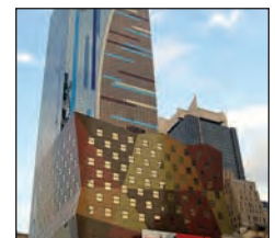
WESTIN TIMES SQUARE

Visit www.cityescapes.com for hotel descriptions