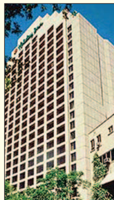
Holiday Inn Riverwalk

PLAN 3A River Cruise (see above) PLUS San Antonio Sights Tour - See all the top sights, including the Alamo.