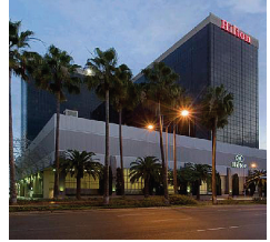
HILTON LAX AIRPORT

INCLUDES: • 3 nights accommodation and tax • Choice grandstand seats near the start of the Rose Parade. Our seats are located on Colorado Blvd., just after the turn from Orange Grove where the Parade begins. This is an excellent vantage point for viewing and picture taking of the many beautiful floats. • Comfortable deluxe motorcoaches to the Parade on January 1 • Full American Breakfast January 1 • Box lunch and refreshments January 1 • Souvenir pin • Hospitality desk service at hotel • Host assistance on January 1 • All taxes and gratuities (except airport and hotel portage)