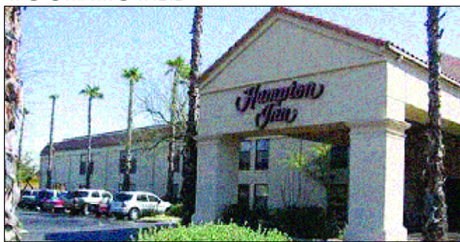
HAMPTON INN SCOTTSDALE