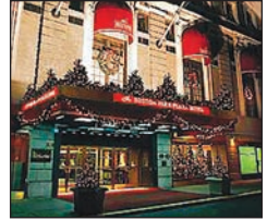
BOSTON PARK PLAZA