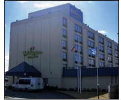
HOLIDAY INN EXPRESS