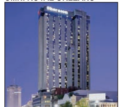
SHERATON NEW ORLEANS

Visit www.cityescapes.com for hotel descriptions