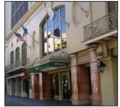
HOLIDAY INN FRENCH QTR