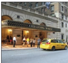
BARCLAY INTERCONTINENTAL EDISON