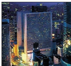
SHERATON NEW YORK