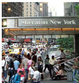
SHERATON NEW YORK