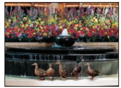
PEABODY HOTEL DUCKS