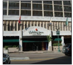
HOLIDAY INN SELECT